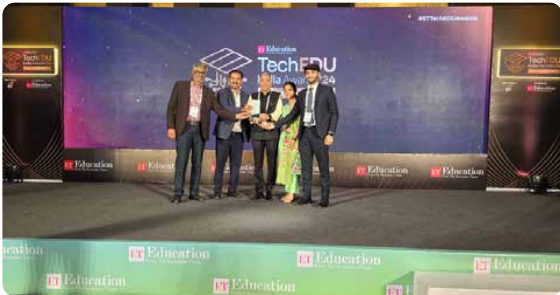
GSV is recognised by ET for Excellence in Industry -Academia Collaboration