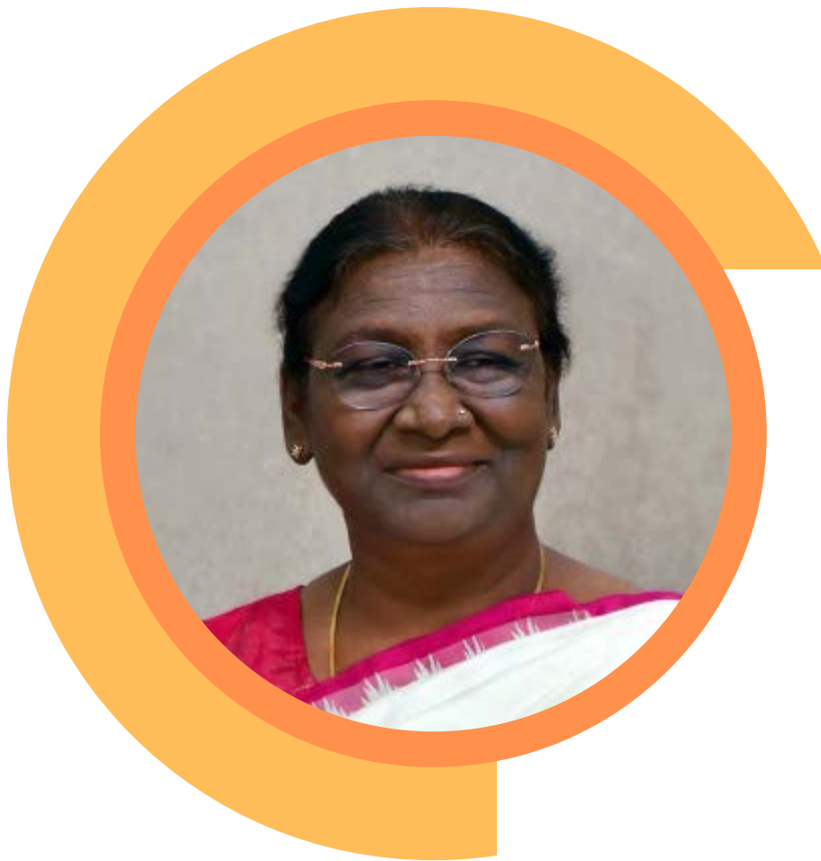
Smt. Droupadi Murmu Hon'ble President of India